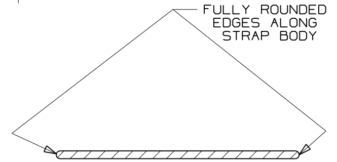
SECTION A - A SCALE 8:1